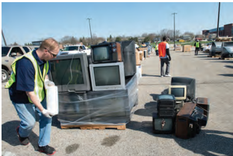
Several community-wide electronic waste collection days are being planned in 2017.

To address this issue, the Village of South Holland provided a drop-off site outside the Public Works garage. Unfortunately, the drop-off service proved to not only be a costly expense for the community, but also resulted in some unforeseen abuses by