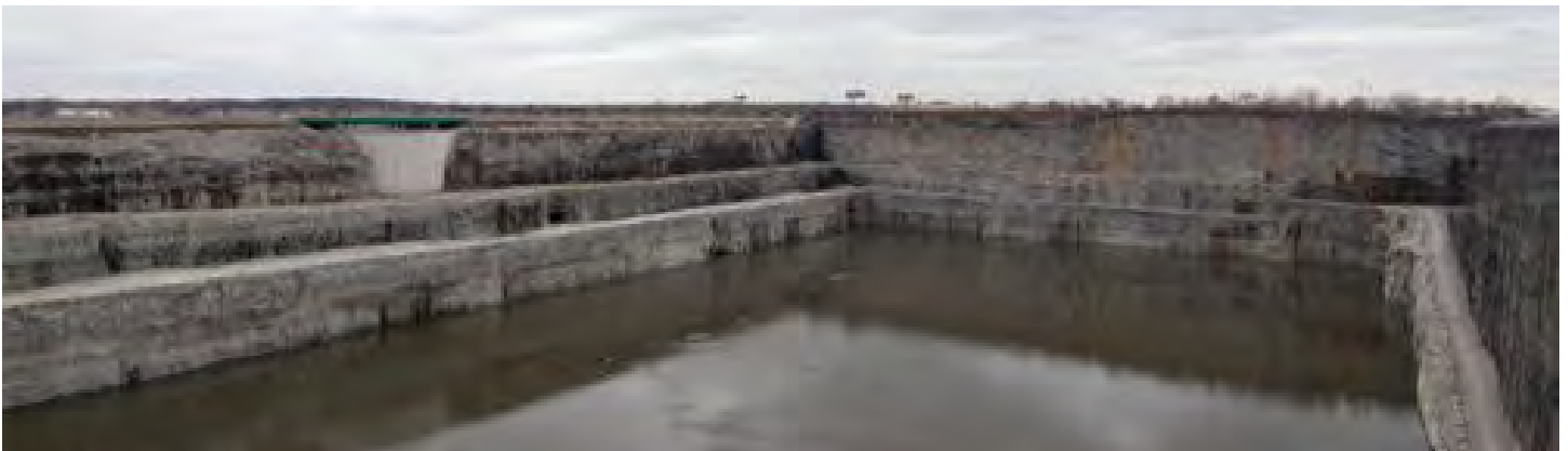
The Thornton Reservoir holds sewer overflows before pumping the water 5.5 miles back to the Calumet Water Reclamation Plant for treatment. Communities that fully, or in part, benefit from the reservoir include Blue Island, Burnham, Calumet City, Calumet Park, Chicago (south side), Dixmoor, Dolton, Harvey, Lansing, Markham, Phoenix, Posen, Riverdale, and South Holland

To report odors, contact MWRD at (800) 332-3867 or visit online at mwrld.org .