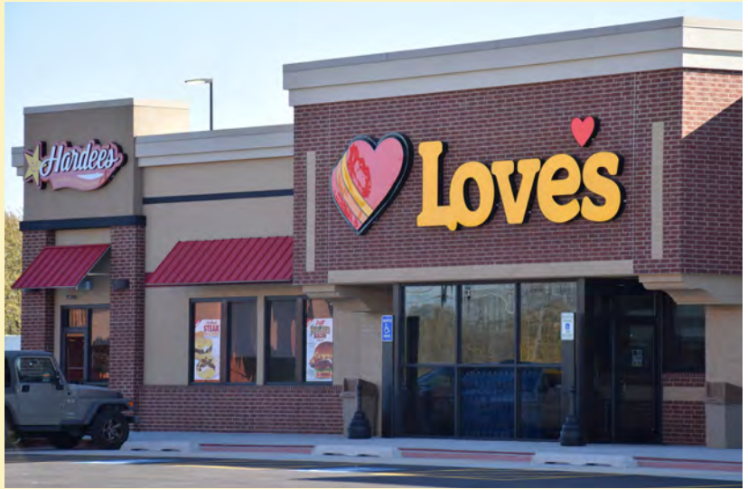
The newly constructed Love's Travel Stop is located in an area where TIF benefits are available for business development and growth. Love's was constructed on land that once was home to Gibson Chevrolet, 1533 East 162nd Street.